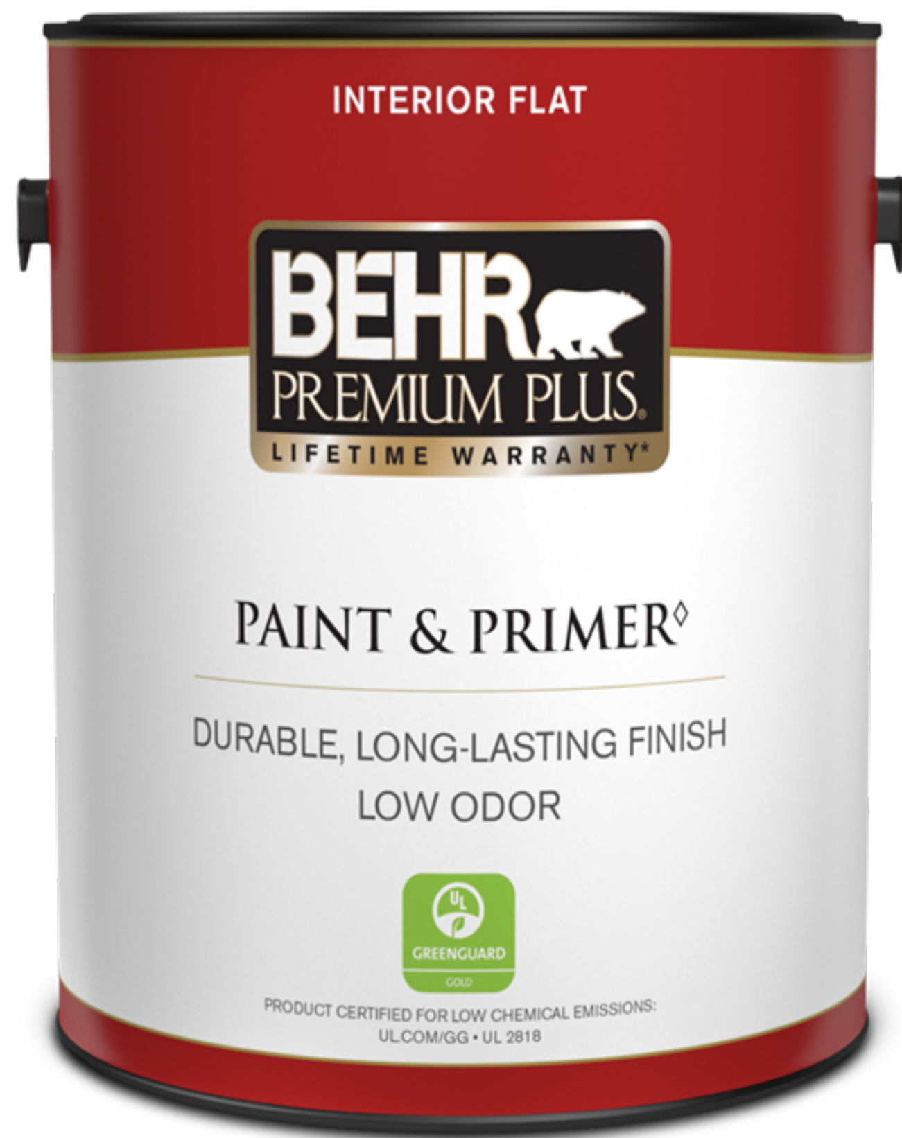
Behr Premium Plus Interior Flat Paint & Primer